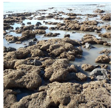
Sabellaria alveolata reef